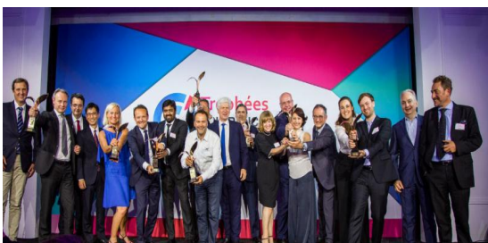
Lots of nominees and winners from US Chambers!

On June 24th, the annual gala and business awards " Trophées CCI France International 2019 " took place in Paris.